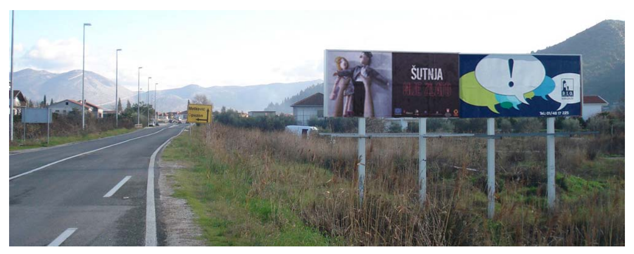
Billboard in Opuzen on the road towards Metković

We have also arranged free media space with providers of spaces for billboards and citylights. We had an agreement with Europlakat to put the citylights and billboards when they have space available, but their previous arrangements prevented them to give any contribution the the campaign. We then contacted company PIO and arranged for the billboards and citylight places. The total value of the billboards places is estimated to be 200.000,00 KN. Please find enclosed the list of billboards and the photos of the billboards.